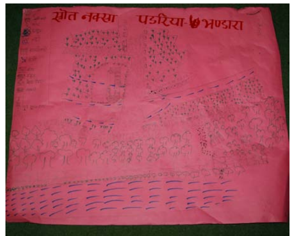
Pic 4: Resource Map

Agricultural lands which are constantly under the threat by local hazard were also identified. People were requested to show the social infrastructures along with major vulnerabilities to disasters, the most affected areas from floods in the recent past, etc by sketching the village map in the ground. In this process altogether 8 people participated.