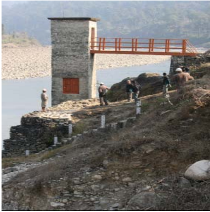
Pic 2 River gauge (Adapted from Practical action, 2008)

information is disseminated to Police offices, local fm stations and mobilization of early warning volunteer is done to evacuate the place. The siren is also used to pass the information as 1 st siren gives people to manage their valuables and livestock's where as second siren is to go towards the safe place or higher ground.