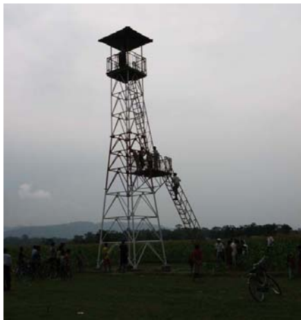
Picture 1 : Early warning tower (Adapted from Practical action, 2008 )

Watch Tower was initiated in the Chitwan district, which lies in the central region of the country and the project was initiated in 2002. Construction of the tower and provision of siren systems were managed by Practical Action while site identification, land purchase, community mobilization, awareness raising and establishing a user committee were the responsibility of the community. Watch tower consist of battery for operating the sirens there is the problem of electricity.